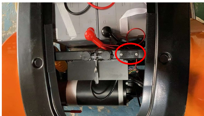
Plate on the frame under the seat, near batteries. Please add an "L" to the front of this number