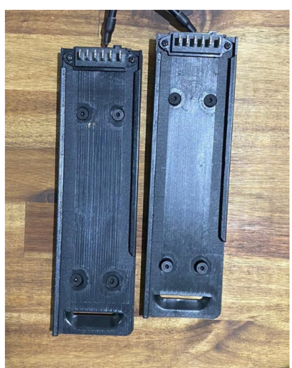
DUAL BATTERY MOUNT