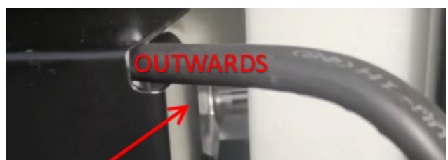
Bolt from Battery