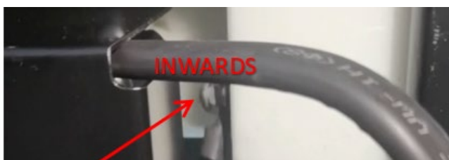
Bolt from Battery